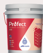
PRØFECT MAJESTIC EXTERIORS