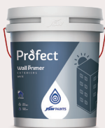
PRØFECT WALL PRIMER EXTERIORS