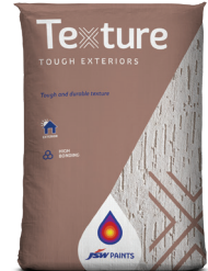
Pack Size : 30 KG

JSW PAINTS TEXTURE is resistant to water and offers excellent protection against humidity, rain and variable climates, thereby ensuring long term protection of your walls.