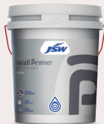
WALL PRIMER EXTERIORS

Our extensive range of water-based emulsions are designed to capture myriad ideas of beauty and evoke a spectrum of emotions that set the perfect ambience.