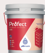
PRØFACT MAJESTIC EXTERIORS