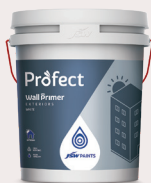
PRØFACT WALL PRIMER EXTERIORS