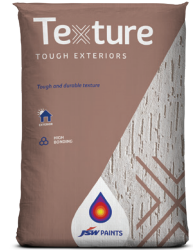
Pack Size : 30 KG

Built for the outdoors, it offers strong resistance to water and delivers reliable protection against humidity, rain, and changing climates, keeping your walls protected for the long run. It's also environmentally responsible, with low VOC levels for a safer, cleaner finish.