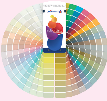
Colour vista Shade Panorama

JSW Paints presents Colour vista Shade Panorama, a splendid collection of 1808 curated shades assembled in tones for every mood. The Colour vista Shade Panorama Fandeck is uniquely designed to easily pick the right colour and choose colour combinations for homes.