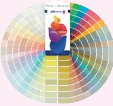
Colour vista Shade Panorama

JSW Paints presents Colourvista, a splendid collection of 1808 curated shades assembled in tones for every mood. The Colourvista Panorama Fandeck is uniquely designed to easily pick the right colour and choose colour combinations for homes.