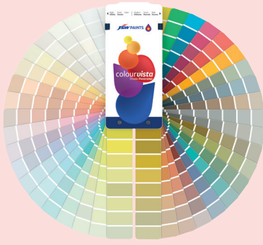
Colourvista Shade Panorama

JSW Paints presents Colourvista Shade Panorama, a splendid collection of 1808 curated shades assembled in tones for every mood. The Colourvista Shade Panorama Fandeck is uniquely designed to easily pick the right colour and choose colour combinations for homes.