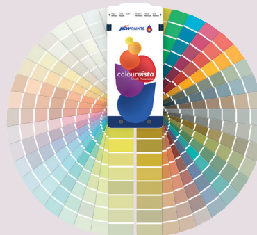
Colourvista Shade Panorama

JSW Paints presents Colourvista Shade Panorama, a splendid collection of 1808 curated shades assembled in tones for every mood. The Colourvista Shade Panorama Fandeck is uniquely designed to easily pick the right colour and choose colour combinations for homes.