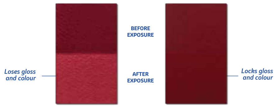
SOLVENT BASED WOOD PANEL