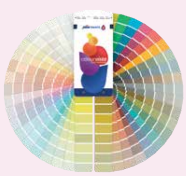
Colour vista Shade Panorama

JSW Paints presents Colour vista Shade Panorama, a splendid collection of 1808 curated shades assembled in tones for every mood. The Colour vista Shade Panorama Fandeck is uniquely designed to easily pick the right colour and choose colour combinations for homes.