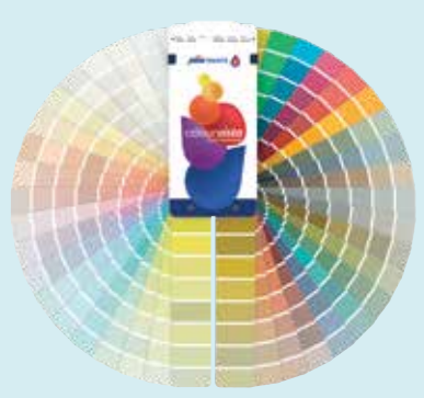
Colour vista Shade Panorama

JSW Paints presents Colourvista Shade Panorama, a splendid collection of 1808 curated shades assembled in tones for every mood. The Colourvista Shade Panorama Fandeck is uniquely designed to easily pick the right colour and choose colour combinations for homes.