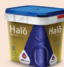
AQUAGLO MAJESTIC GLOSS