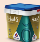
AQUAGLO MAJESTIC SATIN

1 Compliant to LEED (Leadership in Energy & Environmental Design) VOC criteria as per IGBC (Indian Green Building Council) as tested at National Test House, Mumbai. 2 Compliant to GRIHA (Green Rating for Integrated Habitat Assessment) Criterion 26 on Low VOC Interior Paints as tested at National Test House, Mumbai.